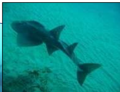
Raggies; Black Tip; Guitar shark