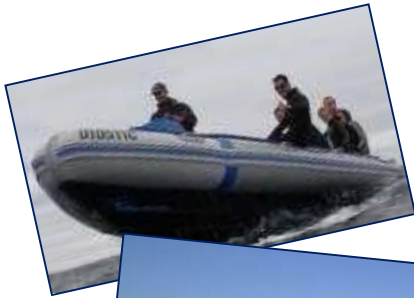
Your dive boat