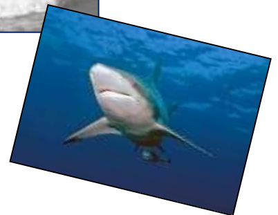
Baited dive at Aliwal s