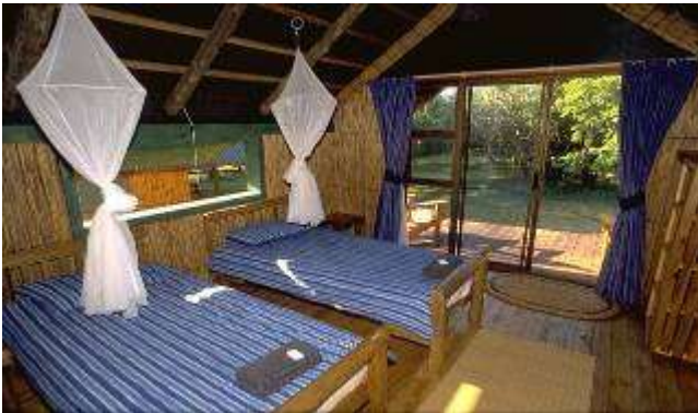
En-suite cabin (inside)