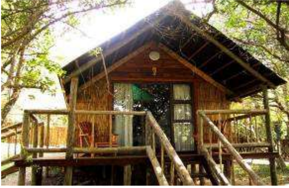
En-suite cabin (front)