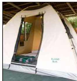
Self Catering Kitchen; cabins; safari tents