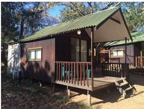
Standard; and Standard private with shower room